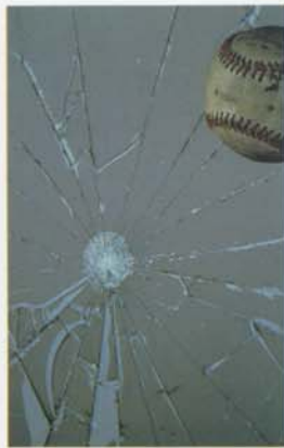
Safety film helps guard against common accidents which often cause personal injury and property damage.

Thickness is the key design feature which separates SCL-Series from other LLumar products. Available in several thicknesses, these super-tough polyester films are the