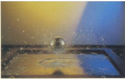
In rigid laboratory tests, a five-pound steel ball dropped from ten feet does not penetrate LLumar film.