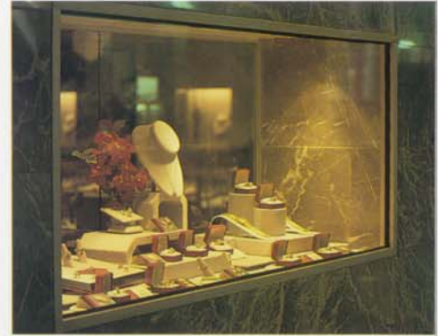
Safety film is an invisible barrier across windows, deterring break-ins and smash-and-grab theft.

special inhibiting agents through a process exclusive to CPFilms Inc. SCL-Series films reject up to 99% of the sun's damaging UV radiation, blocking solar radiation in the UV band to dramatically reduce fading and deterioration behind exterior glass.